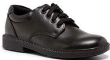
'CLARKS' REWARD LACE UP SHOES