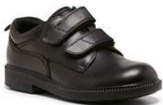
'CLARKS' RELIANCE VELCRO SHOES

DISCOUNT APPLIED AT CHECKOUT. ENDS SUNDAY 2ND DECEMBER 2018. Savings off original prices. While stocks last.