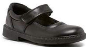
'CLARKS' RAPTURE SHOES