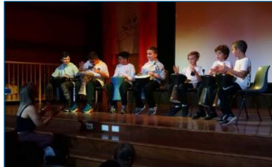
Arncliffe Arabic Entertainers