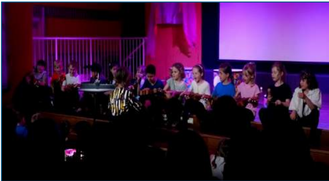
Junior Music Group