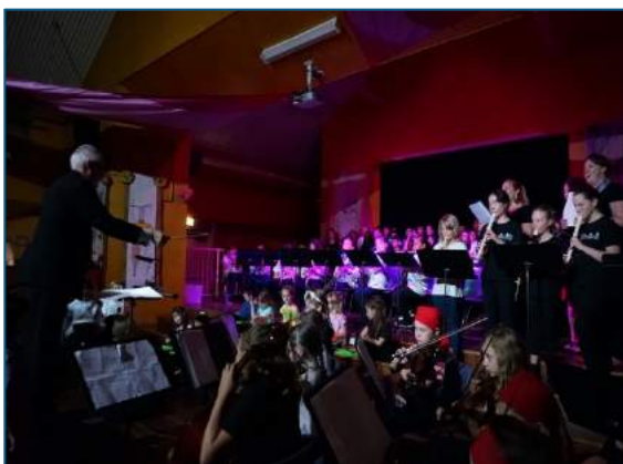
Finale - What a Wonderful