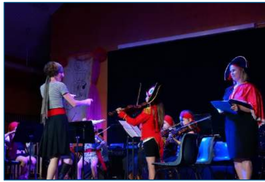
Junior String Ensemble