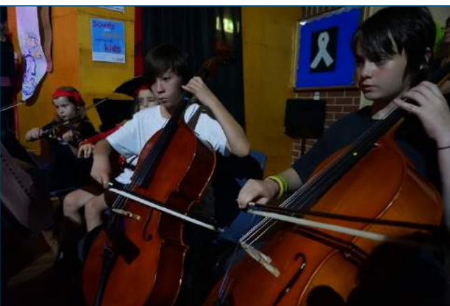
Senior String Ensemble