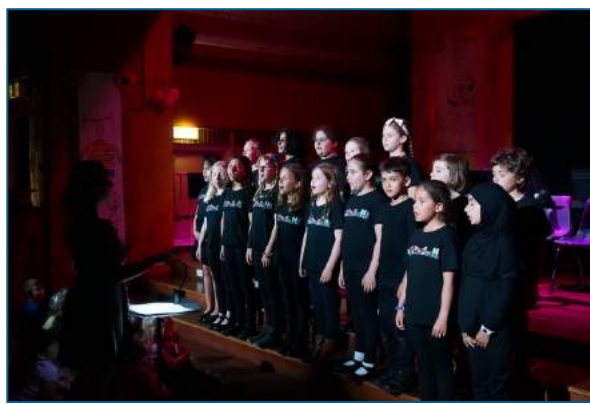
Stage 2 Choir