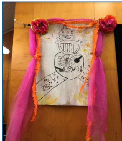
Sets from Art After School